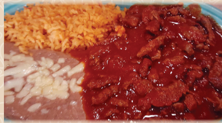
CHILE MEXICANO Your choice of steak, grilled chicken or carnitas cooked in your choice of salsa roja, salsa verde or salsa bang bang, served with rice and beans – 15.99