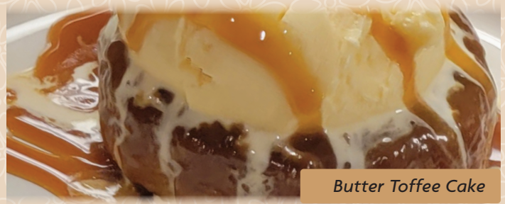
Butter Toffee Cake