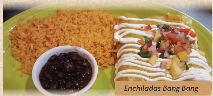
Enchiladas Bang Bang