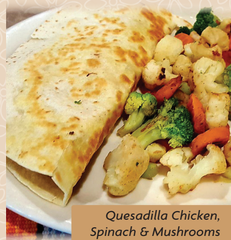
Quesadilla Chicken, Spinach & Mushrooms