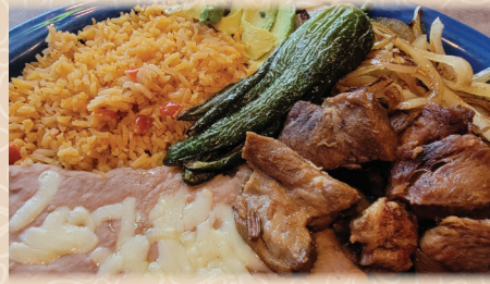
CARNITAS PORK TIPS Served with rice, beans, grilled onions, avocado slices, pickled jalapeno and tortillas – 17.75