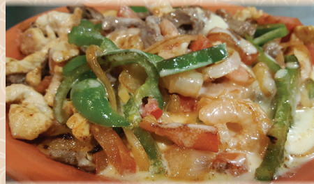
JALISCO SPECIAL Grilled steak, chicken and shrimp cooked with onions, bell peppers and tomatoes, served over a bed of rice and covered with our special cheese sauce half – 13.99 full – 16.99