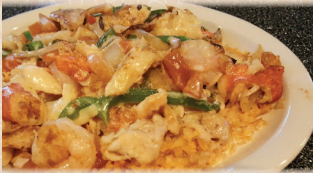
NEW! JALISCO SEAFOOD Grilled shrimp, fish and crab cooked with onions, bell peppers and tomatoes served over a bed of rice and covered with our special cheese sauce – 17.99