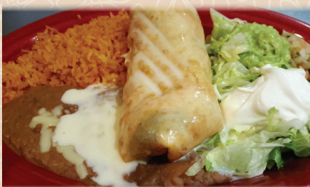
CHIMICHANGA FAJITA Huge chimichanga stuffed with your choice of steak or grilled chicken cooked with onions, bell peppers and tomatoes, served with rice and beans and a Mexican salad – 14.99 with shrimp – 16.99