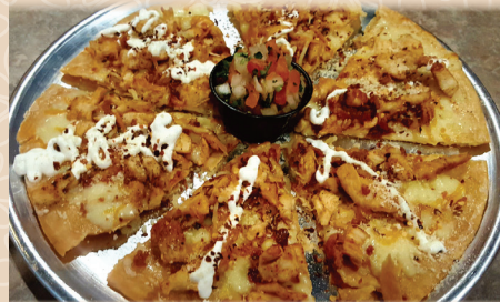
LUNA PIZZA Golden fried flour tortilla topped with your choice of chicken, al pastor or steak, served with shredded cheese, garlic cheese dip, bacon bits, pico de gallo and sour cream – 14.99 shrimp – 17.49