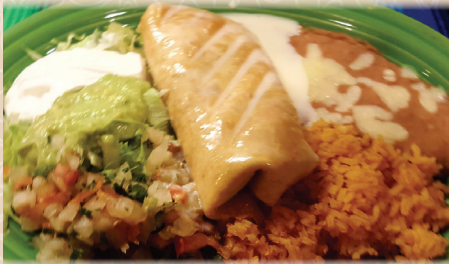
CHIMICHANGA We stuff a flour tortilla with your choice of ground beef or shredded chicken, then deep fried to a golden brown smothered with cheese sauce and served with rice, beans and a Mexican salad – 12.49