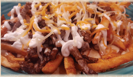
CARNE ASADA FRIES French fries topped with grilled steak, cheese sauce, sour cream, pico de gallo, and shredded cheese – 16.75