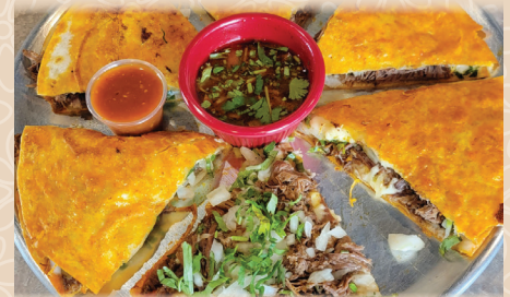
NEW! BIRRIA PIZZA Double tortilla stuffed with birria beef and fresh cilantro, and onions. Served with consome and tomatillo hot sauce – 19.75 large – 25.75

Shredded chicken is prepared with onion, bell peppers, and tomatoes.