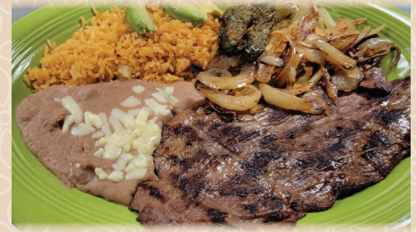
CARNE ASADA Thinly sliced steak served with rice, beans, grilled onions, avocado slices, fried jalapeno and tortillas – 17.75