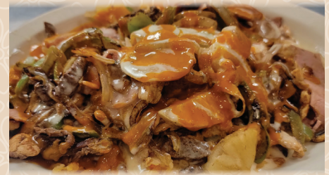
NEW! LUIGI SPECIAL Grilled chicken, steak, bell peppers, onions and mushrooms, served over a bed of rice covered with our cheese sauce and salsa chipotle – 17.99