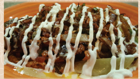
LOADED POTATO Large potato with grilled chicken or steak, sour cream, onions, bell peppers, tomatoes, bacon bits, covered with cheese sauce – 16.75