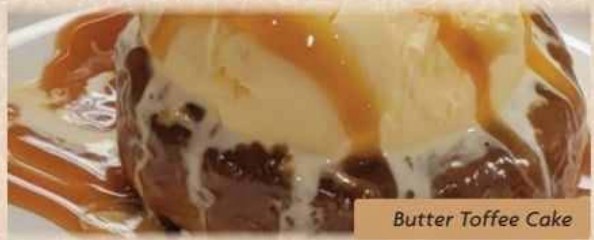
Butter Toffee Cake