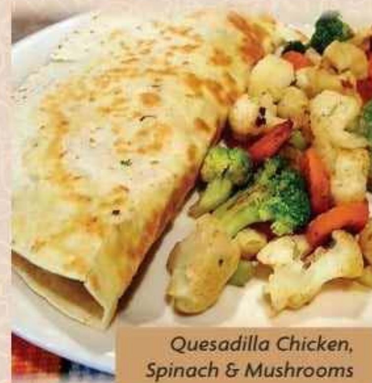
Quesadilla Chicken, Spinach & Mushrooms