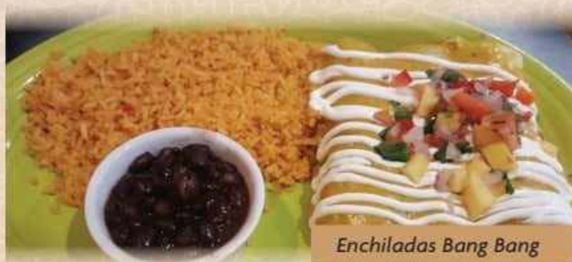
Enchiladas Bang Bang